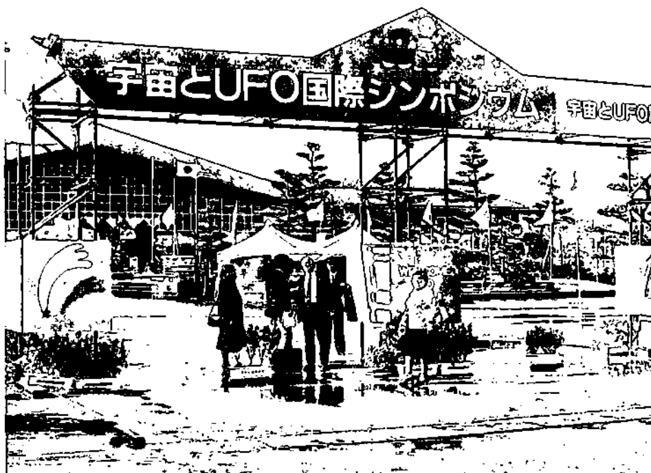
Entrance to the UFO town of Hakui City, Japan

The advance planning was more than evident. Widely advertised ahead of time, the UFO and space exhibits occupied several floors of the city's main cultural center. One floor, devoted to space exploration, was decorated with numerous displays of manmade spacecraft, from the early astronaut days to the moon landing. These included two actual moon rocks and a mock-up of a proposed moonbase. Another floor contained a large UFO photo exhibit featuring sightings from around the world. "Space Girls" in special uniforms served as guides.